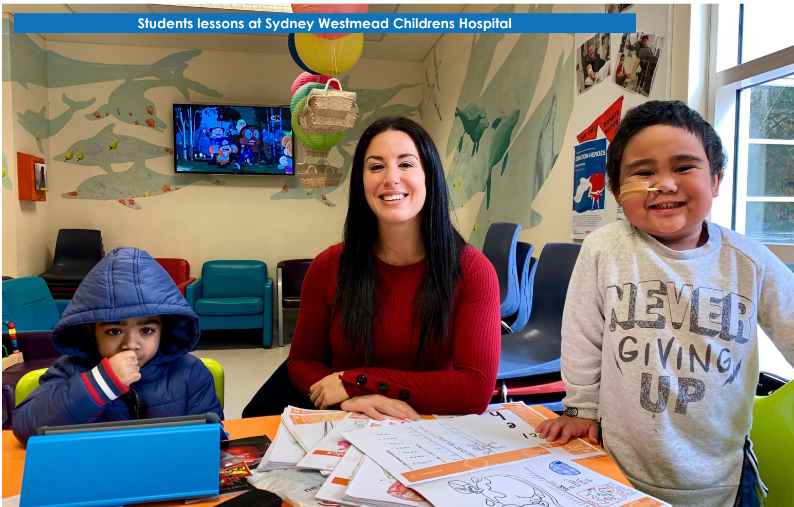
Students lessons at Sydney Westmead Childrens Hospital

NB: If requiring lessons from the start of the school year, apply early in Term 4 of the previous year.